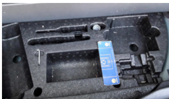
In the above image the tyre inflator is missing.