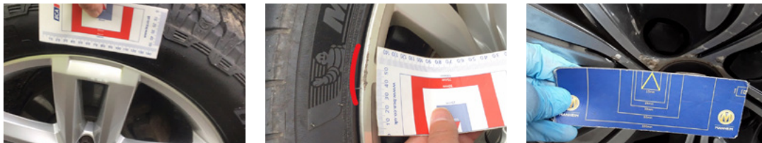
CHARGES APPLICABLE TO OVER 50MM. IMAGE 2 SHOWS 40MM WHICH IS WITHIN TOLERANCE.